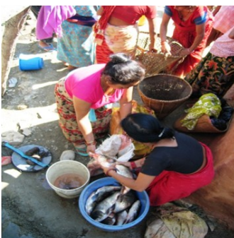
Local women selling the fish harvested by them