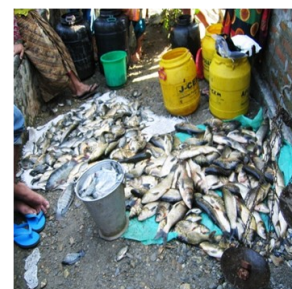
Production of upper pond and lower pond

333 m 2 . BPC and SPRN has provided necessary training on nursery development and propagation, management, harvesting, processing and marketing activities as an integral part of the project. During the operation period women group harvested 160 kg fishes for the first time in cont in page 4