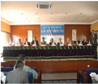
18 th Annual General Meeting