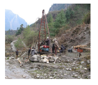
Core Drilling at Headworks Area

staff gauge reading are ongoing at the site. Contract agreement has been made with Bernard Ingenieure for Computational Fluid Dynamics (CFD) Study of Headworks on March 8, 2011 and the analyses work is ongoing. Study on Marketing and Evacuation of Power for LMMHEP has been completed. Draft Report of Land Acquisition also has been completed.