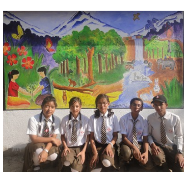
One of the mural paintings drawn on WED

consciousness towards environment, the place where heaps of garbage produced by community was piled can be converted into a beautiful place. Mural Painting on the wall of BPC Office Building was